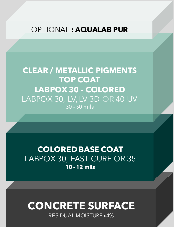
Decorative / Metallic