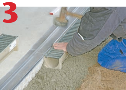
Lay channels starting at outlet. Set a string line at required height to ensure level. Seal joints if required.