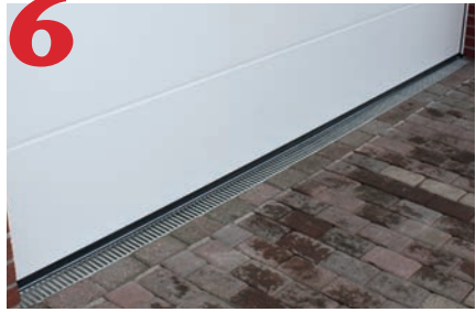
Clean away debris, remove protective plastic.

© May 2018 ACO, Inc. All reasonable care has been taken in compiling the information in this document. All recommendations and suggestions on the use of ACO products are made without guarantee since the conditions of use are beyond the control of the company. It is the customer's responsibility to ensure that each product is fit for its intended purpose and that the actual conditions of use are suitable. ACO, Inc. reserves the right to change products and specifications without notice.