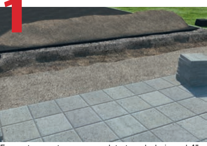
Excavate area to accommodate trench drain and 4" concrete surround