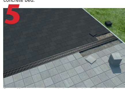
Pour 4" concrete around channel sides allowing for pavement detail (see section drawing above).