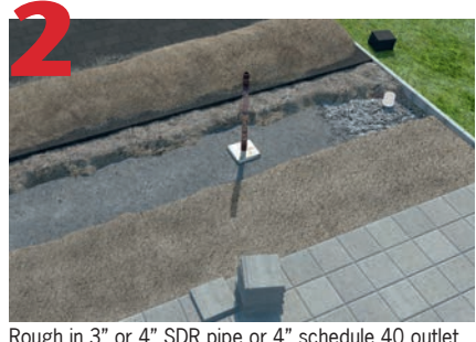
Rough in 3" or 4" SDR pipe or 4" schedule 40 outlet pipe, compact excavation base and lay 4" deep concrete bed.