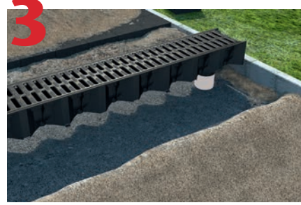
Knockout channel base for outlet and start to lay channels from outlet position.