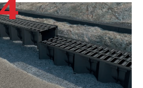
Continue to lay channels working away from outlet, channels slide-fit together.