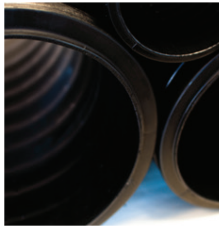
BOSS 2000 VARIOUS SIZES TO ACCOMMODATE ALMOST ANY PROJECT

If you wish to specify HDPE for your storm sewer application the following is suggested: HDPE in accordance to CSA Group specification B182.8, with Type 1 water-tight joints (75 kPa).