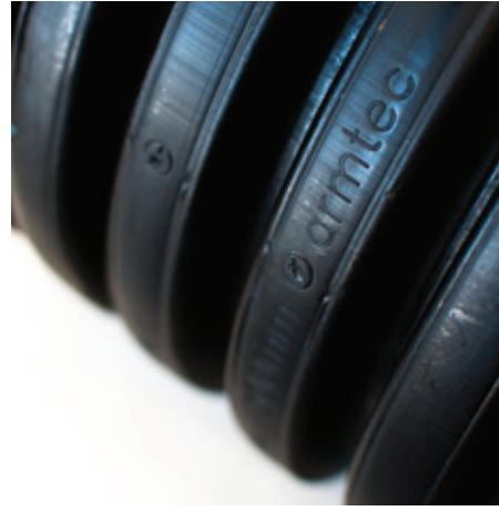
BOSS 2000 DETAIL OF 300mm