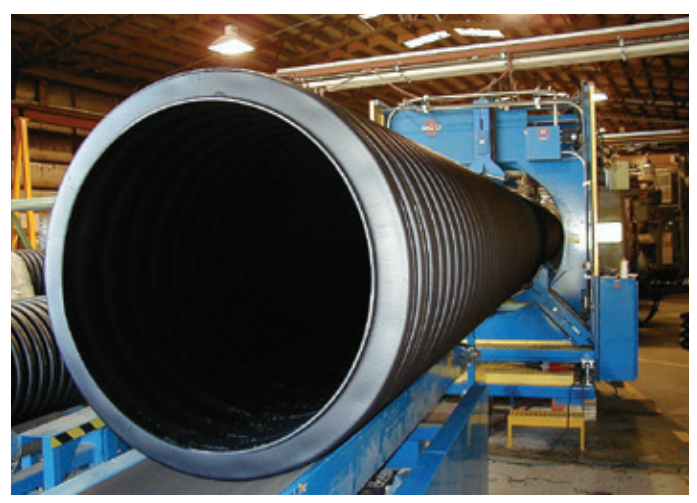
BOSS HDPE PIPE PRODUCTION USES ADVANCED MANUFACTURING TECHNOLOGY