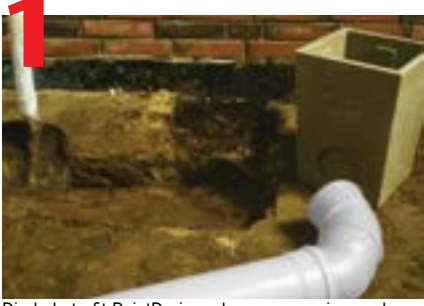
Dig hole to fit PointDrain and necessary pipe-work.