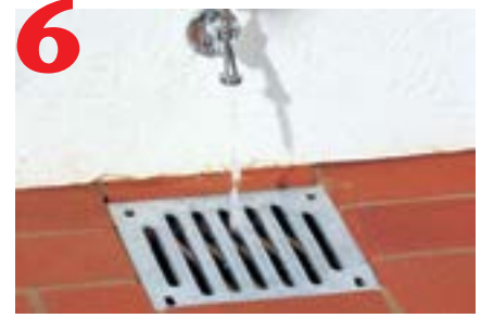
Ensure finished surface is 1/8" higher than the grate to assist water drainage.

Electronic Contact info@acocan.ca www.acoself.com