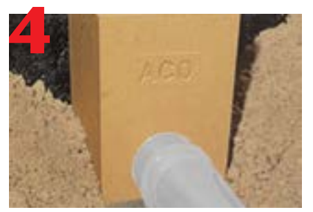
Connect drainage pipe, check for leaks before backfilling.