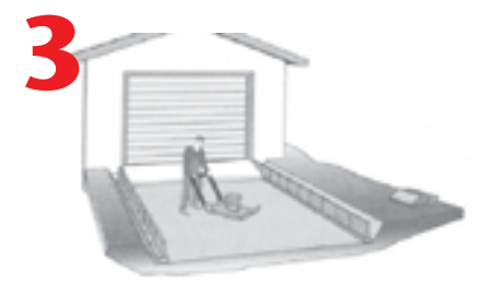
Position PointDrain on a 4" thick concrete slurry bed and ensure it is level.