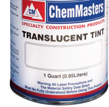
Easy to Use - Pour 1 or 2 quarts of Translucent Tint into a 5-gallon pail of a clear, solvent-based, ChemMasters sealer or cure & seal and stir.

The standard application rate for Translucent Tint is 1 quart (single) or 2 quarts (double) per 5-gallon pail of clear acrylic sealer. The dosage rate used depends on the decorative effect desired. Using a double dose of Translucent Tint per pail will darken and deepen the color more than a single dose.