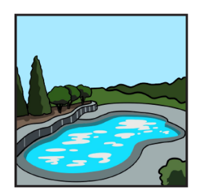
POOLS AND PATIOS