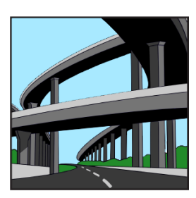
ROADS AND BRIDGES