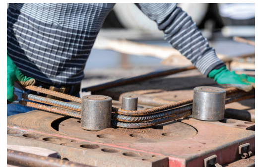
CUSTOM REBAR Cut and bent to order