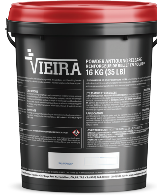
POWDER RELEASE AGENT 6 colours 16Kg Pail