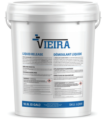
LIQUID RELEASE AGENT Scented 18.9L Pail