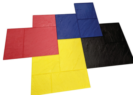
CONCRETE STAMPS Rigid and Seamless Stamps Unique Designs