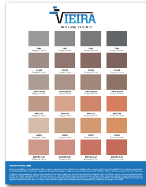
INTEGRAL COLOUR 6 Colours x 4 Shades 5Kg Repulpable Bag