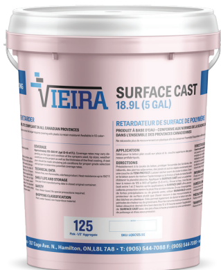
SURFACE CAST RETARDER 7 grades in stock No plastic required