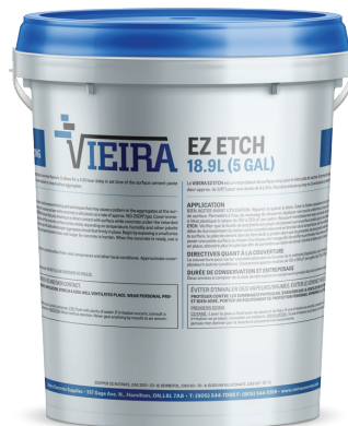
EZ ETCH SURFACE RETARDER Coloured for visibility 18.9L Pail