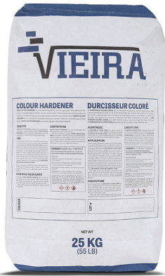
COLOUR HARDENER 20 Colours 25Kg Bag