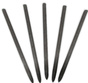
NAIL STAKES 3/4" x 12", 18", 24", 30", 36", 48" With or without holes